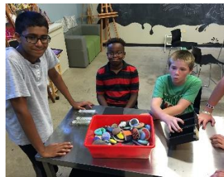
Teen Led Workshops